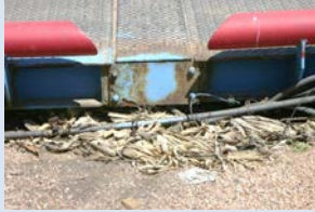
Debris beneath scale