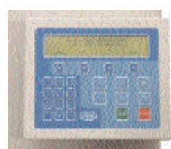
Machine Control Console